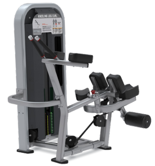
KNEELING LEG CURL 9NA-S1311