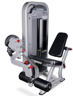
LEG EXTENSION 9NA-S1312