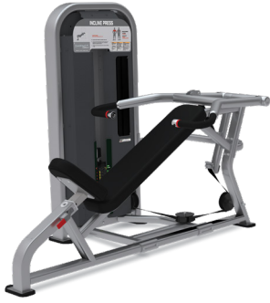
INCLINE PRESS 9NA-S2301