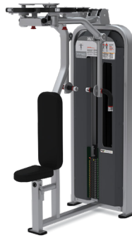
DELTOID FLY 9NA-S4304