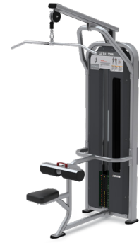
LAT PULL DOWN 9NA-S3305