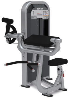
BICEPS CURL 9NA-S5301