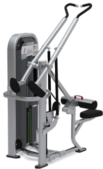
FIXED LAT PULL DOWN 9NA-S3303