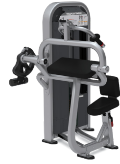
TRICEP EXTENSION 9NA-S5302