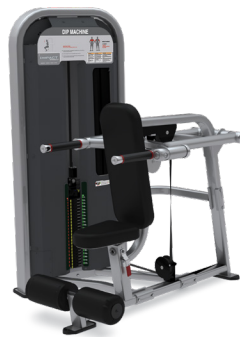
DIP MACHINE 9NA-S5303