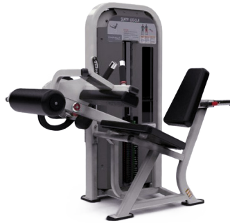
SEATED LEG CURL 9NA-S1313