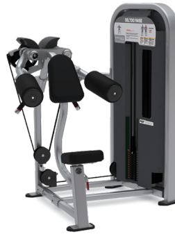
DELTOID RAISE 9NA-S4302