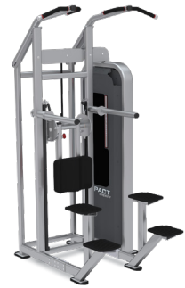
CHIN DIP ASSIST 9NA-S6334