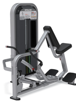
VERTICAL ROW 9NA-S3301