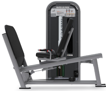
SEATED LEG PRESS 9NA-S1305