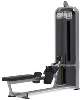
LOW ROW 9NA-S3306