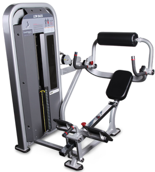
LOW BACK 9NA-S3302