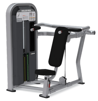
SHOULDER PRESS 9NA-S4307