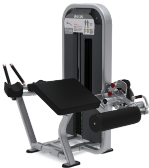
LEG CURL 9NA-S1301