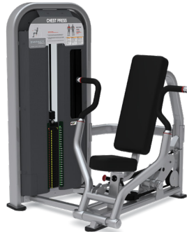
CHEST PRESS 9NA-S4301