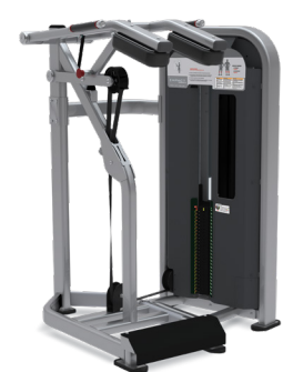
STANDING CALF 9NA-S1309